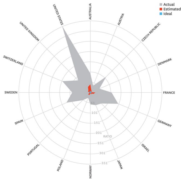
Fig. 3. Actual, estimated and ideal pay ratios of CEOs to unskilled workers in 16 countries. Figure 3 includes the estimated (red) and ideal (blue) data from Figure 1, but estimates and ideals are so much smaller than actual pay ratios that they are nearly invisible. Countries are arranged in alphabetical order. The center of the diagram represents a pay ratio of 1:1 (i.e., equal pay); the outermost ring represents a pay ratio of 351:1. Red indicates the estimated pay ratio by respondent country, blue indicates the ideal pay ratio by respondent country, and gray indicates the actual pay ratio by country.

We grouped respondents into three age groups: less than 35 years old, 35–54 years old, and 55 years old and above. We grouped respondents into six groups by their education. For subjective socioeconomic status, we grouped respondents into five groups (quintiles): those who answered 1 or 2 were classified as the bottom (poorest) 20%, 3 or 4 the second 20%, 5 or 6 the middle 20%, 7 or 8 the fourth 20%, and 9 or 10 the top (richest) 20%.