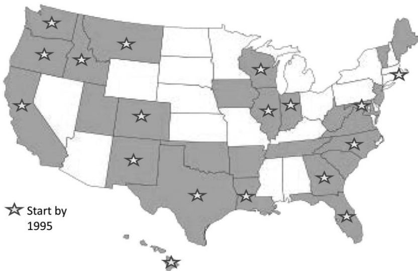
FIG. 1.—LEHD state coverage. Stars indicate the primary sample of 18 states whose coverage begins by 1995. The figure indicates with shading the states that are covered by the LEHD. Alaska is not covered. Coverage for all states ends in 2008.

We identify major employers using a number of different sources, starting with the Census Bureau's Longitudinal Business Database (LBD), which contains annual employment records for all establishments in the United States. Aggregating to the firm level by summing across establishments, we