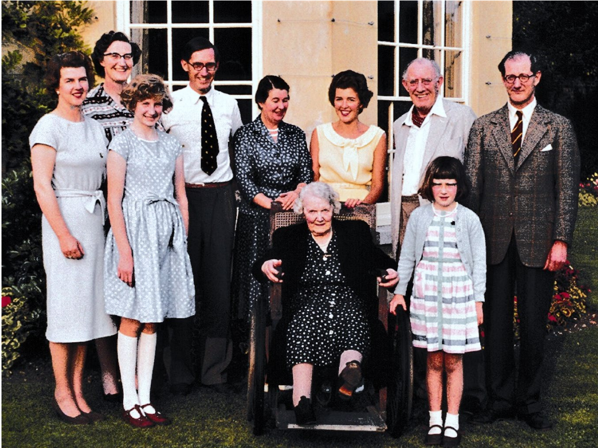
Left to right: 1. Barbara, wife of John Saunders (Cicely’s and Christopher’s brother). 2. Cicely. 3. Penelope, John & Barbara’s daughter. 4. Christopher. 5. Mrs. Doreen Diamant, Gordon Saunders’s companion and very old, widowed friend. 6. (in wheelchair) Daisy Saunders, Gordon’s sister. 7. Shirley, Christopher’s wife. 8. Gordon, Cicely’s and Christopher’s father. 9. Sarah, John & Barbara’s daughter 10. John Saunders.