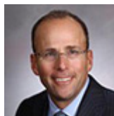
Jonathan Kraft, MBA President The Kraft Group