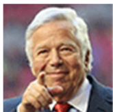
Robert Kraft, MBA Founder, Chairman and CEO The Kraft Group