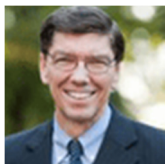
Clayton Christensen, DBA, MPhil, MBA Kim B. Clark Professor of Business Administration Harvard Business School