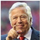
Robert Kraft Founder, Chairman and CEO The Kraft Group