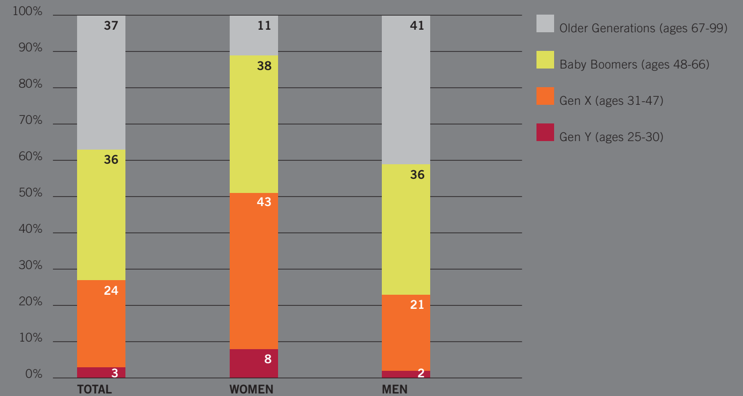
Figure 1: Generations by Total and Gender

HBS alumni encounter many different opportunities and challenges after their time at the School, including family roles and personal responsibilities. About nine out of ten (87%) alumni are married or partnered and about the same proportion have children. 2 About one-third (31%) have children under age 18 living at home. In all generations but Generation Y (ages 25 to 30), men are more likely than women to have children. One-tenth of alumni expect to have their first or another child in the future.